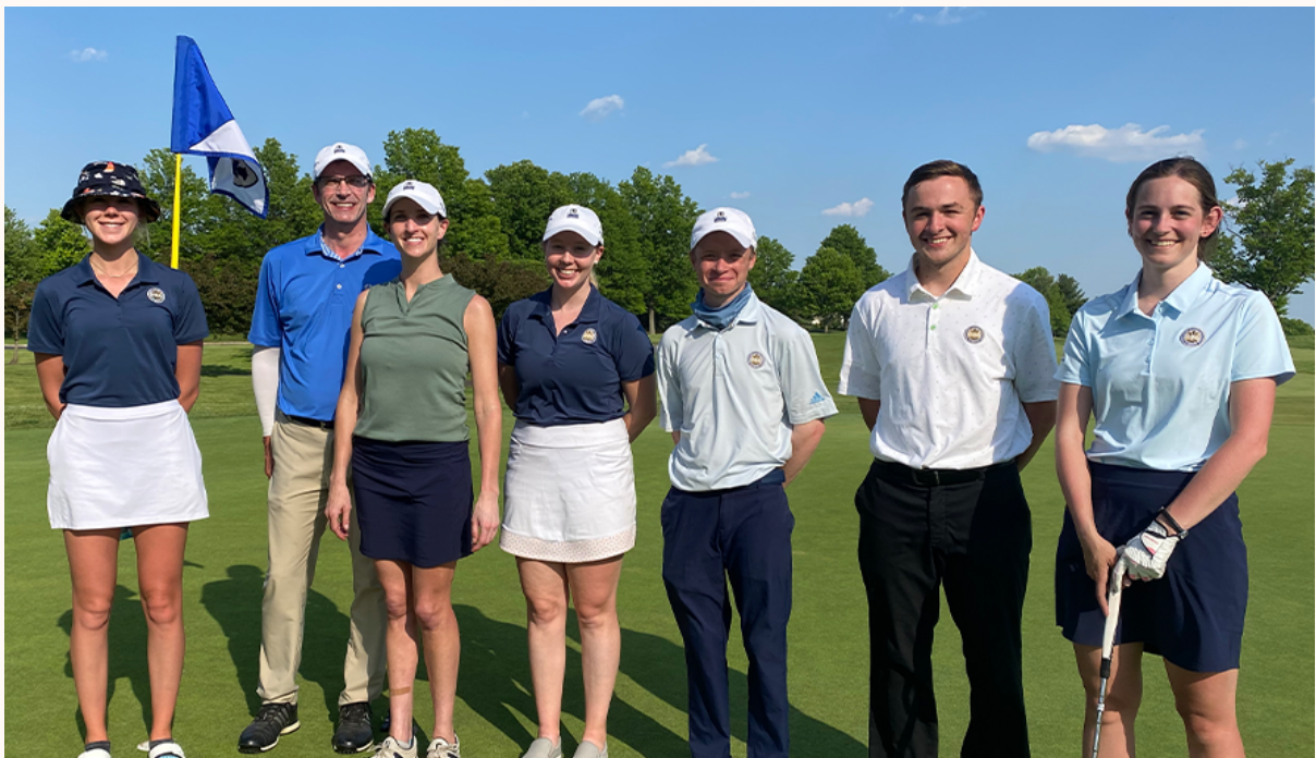
Section staffers jumpstarted the PGA REACH Philadelphia Golf Marathon season at Blue Bell C.C. on May 19th.

Participants kindly request donations to support their fundraising efforts. So far in 2021, there has been $2795.00 raised and that number is only going up. If interested in donating or registering, please visit this link .