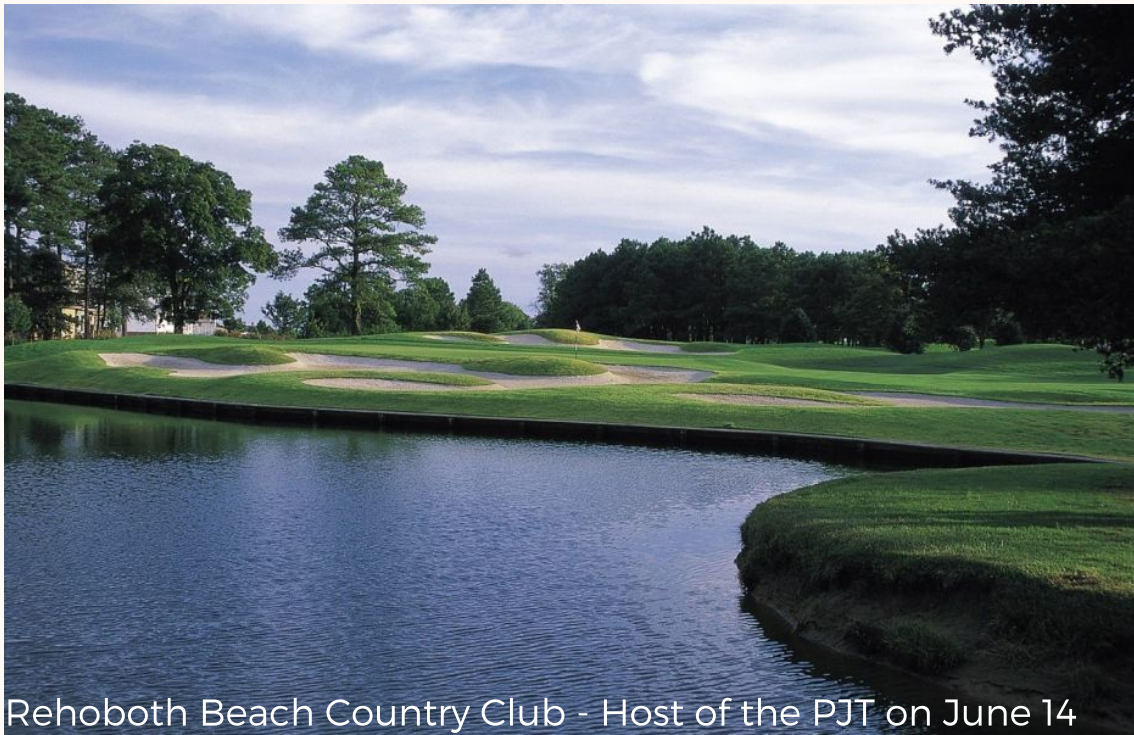
Rehoboth Beach Country Club - Host of the PJT on June 14